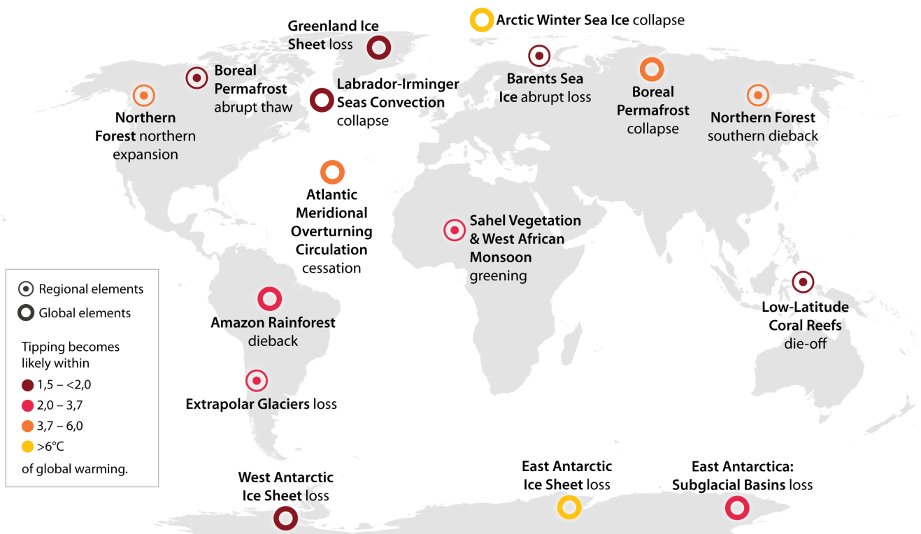
Fig. 1. A map of climate tipping elements, i.e., Earth system subdomains that determine the state of the climate system and are susceptible to dramatic change if global warming crosses threshold values corresponding to their tipping points. The ranges of global warming values where a tipping point is found for a specific tipping element are presented in colors (yellow for <2 °C, orange for 2 to 4 °C, and dark red for ≥4 °C). The map is derived from Armstrong McKay et al. (6) and printed with permission from the American Association for the Advancement of Science. See SI Appendix, Glossary for key definitions.

Crossing the tipping points will not only have environmental implications as their structure and functioning change (e.g., from stable to erratic regional rainfall) but is also likely to disrupt socio-economic and political systems that have developed with and are reliant on the stability of the Holocene (23). For instance, around 400 million people would directly suffer from a demise of tropical corals (51), and at 3 °C of global warming, over three billion people would be living in regions with health-threatening levels of heat (52). The same is true for the planetary boundaries, which, despite critique (reviewed in ref. 53), are considered precautionary "scientific assessments about what is safe, dangerous and unacceptable" (54, p. 83). Transgressing boundaries and undermining the functioning of biophysical systems already have severe multispecies justice implications for present and future